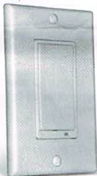
Shown with supplied Decora™ trim plate

Note: This module must be "Included in the Network" only where it will be permanently installed. The proper operation of this node in the mesh network is dependent on it knowing its location with respect to other nodes. You cannot "test bench" configure this module.